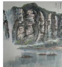
The Freshness after Rain (24in x 36in) March 2006