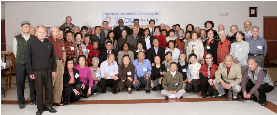
Members of Governor Granholm's Advisory Council on Asian Pacific American Affairs (ACAPAA) and ACA Senior Club members.