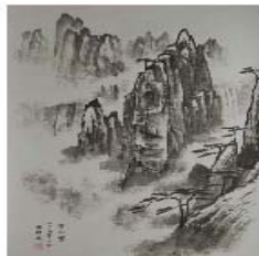
Clouds in the Huangshan Mountain (20in x 27in) February 2006