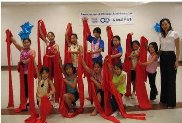
Chinese Folk Dance Group at 2007 Summer Camp

There are numerous ways to become involved in ACA and its great mission. We are inviting you to become a volunteer to contribute in the area of your expertise, financially support our programs, or simply participate in the events held by ACA throughout the year.