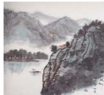
Xiajiang River View (22in x 26in) June 2004 2 nd Prize in the 2004 US National Youth Art Competition