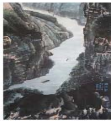
Xiajiang River Scenery (18in x 27in) May 2006 2 nd Prize in the 2006 US National Youth Art Competition