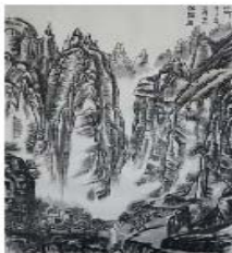
River Mountain (18in x 27in) March 2002 1 st Prize in the 2002 Michigan Chinese Youth Art Competition