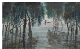
Cruising after Rain (22in x 18in) March 2006