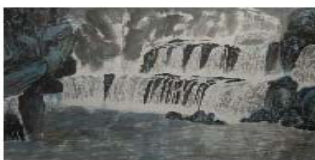
Water Falls (36in x 24in) April 2006